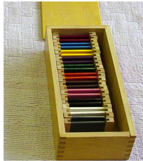
Box II (11 color pairs)

1) Using two hands, carefully carry either box to the rug.