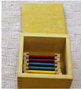
Box I (3 color pairs)

Original Idea: Matching colors; learning the names of the colors.